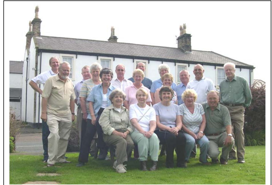
The Levellers outside the Dunstanburgh Castle Hotel in September